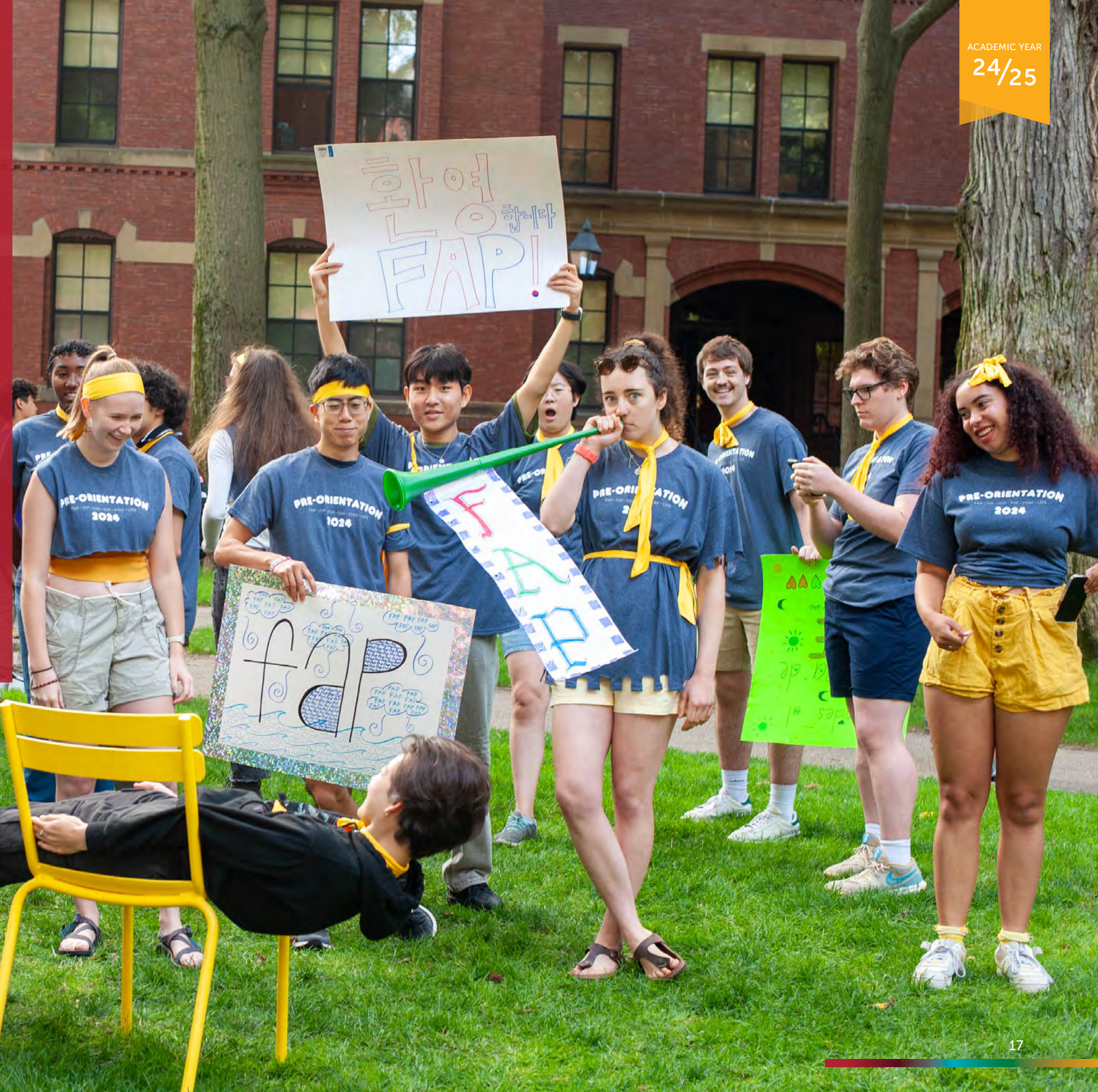
Photo: Upper-class FAP proctors provide a gateway to the arts for first-year students.

In its 30th year, the OFA First-Year Musical is an annual tradition in which first-year students write, compose, direct, and perform an original musical in the spring. This program takes place in partnership with the First-Year Experience Office and the First-Year Arts Program.