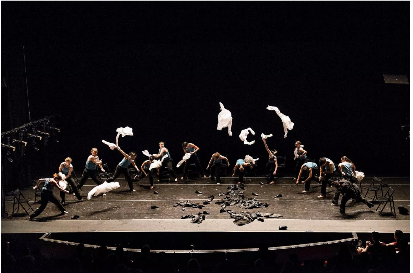
Harvard Dance Project performs Ohad Naharin's "Echad Mi Yodea" at Farkas Hall.